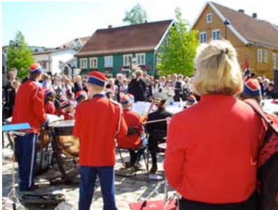
School Band Playing