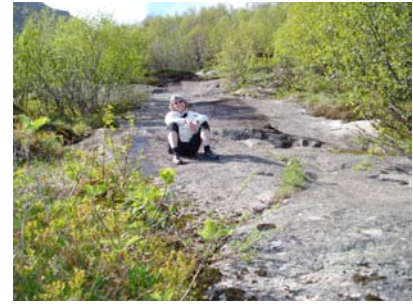
Resting on the climb up