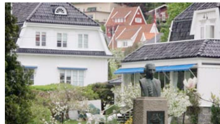
Drøbak City Park