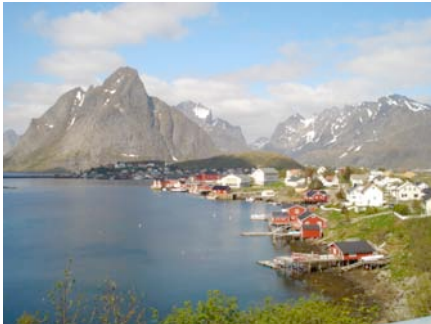
View to Reine