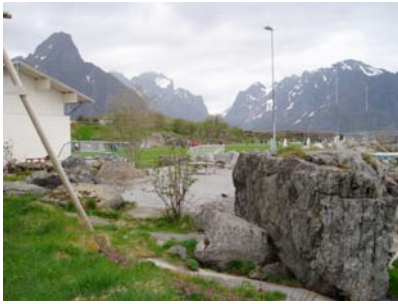
Snow Capped Mountains