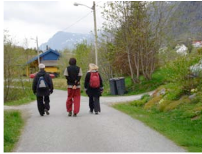
Walking Tour with Guide