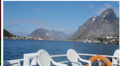
View on Reine fjord