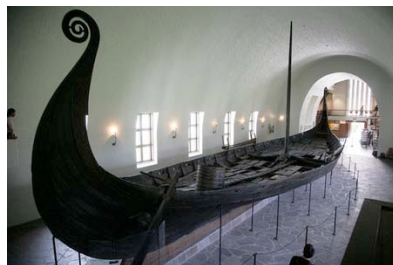
Viking Ship Museum